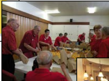
Lunches for Homeless (With Salvation Army)