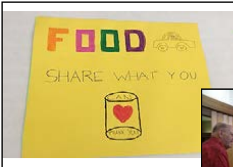
Valley View Food Bank Neighborhood Drive