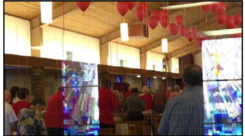
Stained Glass Reflected into the Nave

Yours in Christ's Love, The Congregation of St. Christopher's