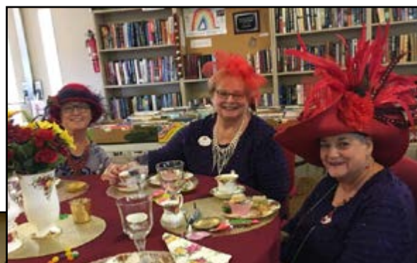
Women's Club Tea