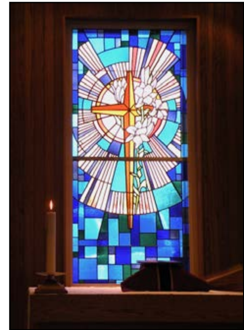
Chapel Stained Glass behind Altar