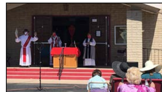
2021 Palm Sunday

1st in-person service since March 14, 2020