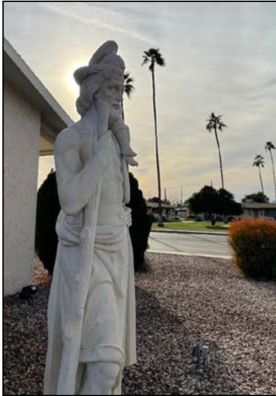
Statue of St. Christopher in the Front Yard