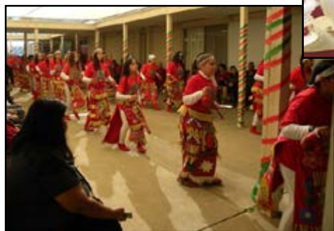
La Danza a la Virgen Celebration