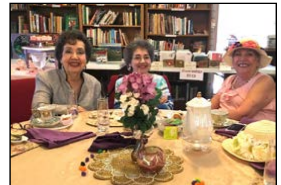
Women's Club Tea

The kitchen committee keeps the fridge and freezer cleaned out. The women provide daily devotional materials to all in both English / Spanish. They support the diaper drive for babies in Phoenix and the West Valley, conduct the twice annual UTO Ingathering, and conduct social and other activities including a Day with the Diamondbacks, a chili cook-off, a game day, and a Christmas sale.