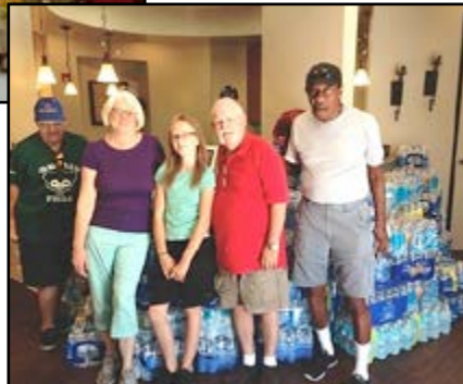
Summer Water Drive