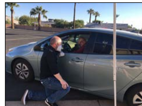
Visit the Vicar - Parking lot communion and prayer distribution