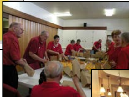
Lunches for Homeless (With Salvation Army)