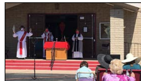
2021 Palm Sunday

1st in-person service since March 14, 2020