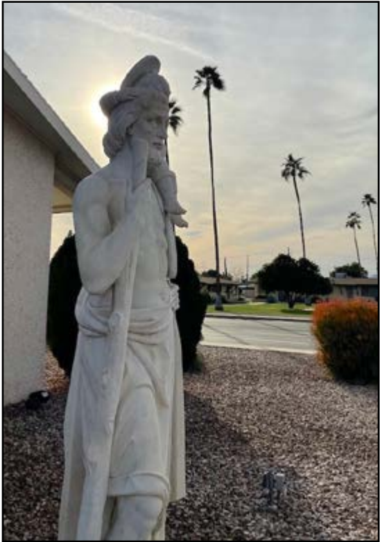
Statue of St. Christopher in the Front Yard