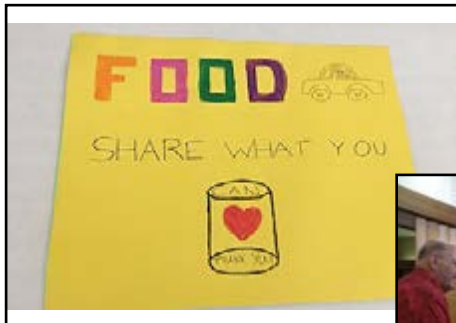
Valley View Food Bank Neighborhood Drive