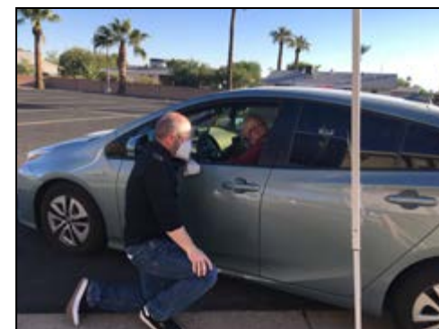
Visit the Vicar - Parking lot communion and prayer distribution